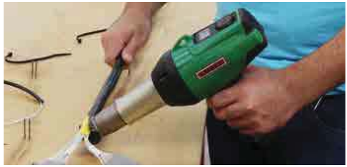
Shrink applications in cable manufacturing – ideal with the GIBLI AW

practical device suspension make working easier. The air filters can be readily removed and cleaned. And of course, all of the nozzles from its predecessor fit the new GIBLI AW.