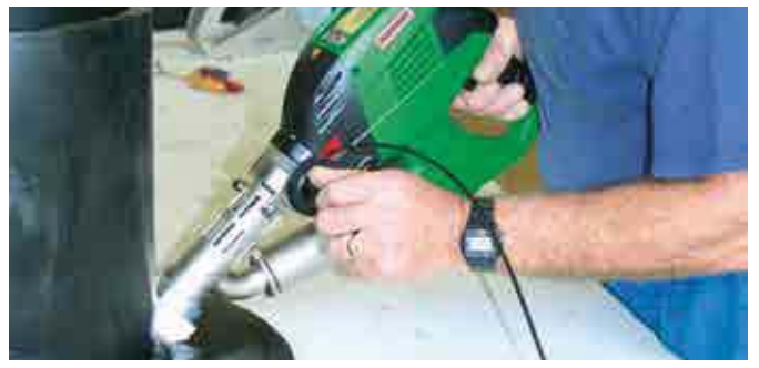
The handy WELDPLAST S2 in action.