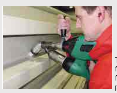
The 45° angled adapter for the WELDPLAST S2 facilitates welding in difficult positions. (accessory)