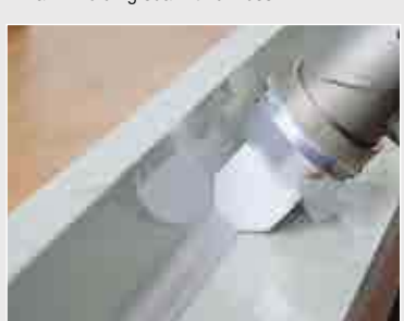
With the WELDPLAST S2 perfect welds are possible